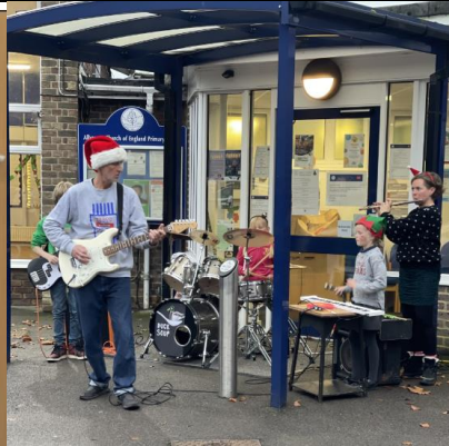
The Steiner Family Starlings WW2