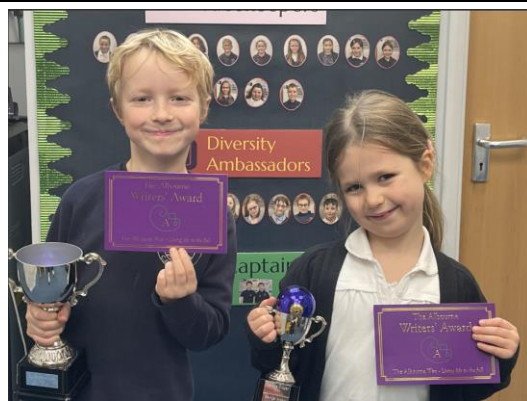
Albourne Writers' Award winners