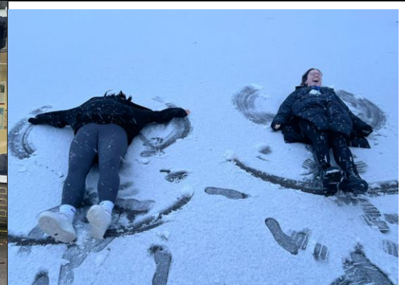
Staff Snow Angels