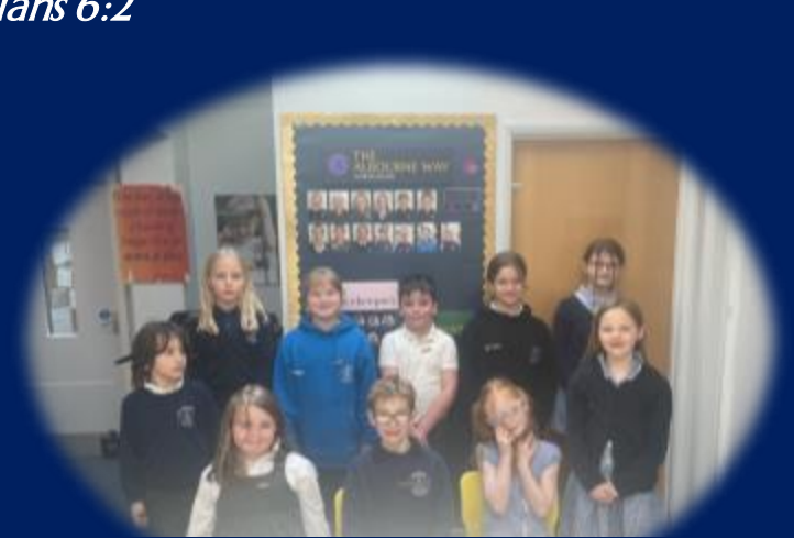
Our Diversity Ambassadors are role-models in improving understanding about differences