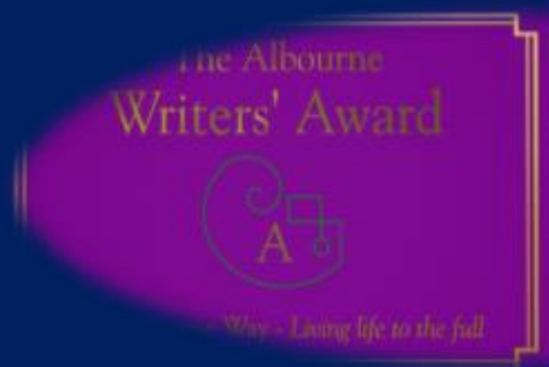
Ambitious for children to fulfil their potential