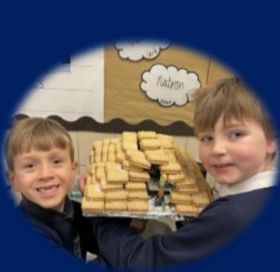
Exciting homework projects

We are committed to ensuring a broad and balanced curriculum, enriched with skills, knowledge and experience that equip pupils for the future. The curriculum is broad, rich and ambitious, underpinned by its Christian vision and values. ‘The heart of the discerning acquires knowledge, for the ears of the wise seek it out.’ Proverbs 18:15