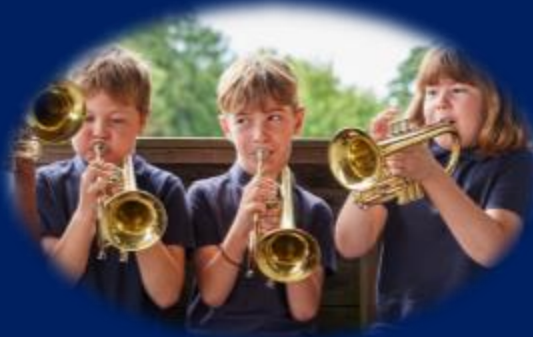
In Y4, children learn to play the djembe, ukulele and cornets.