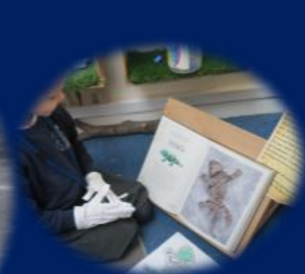
A letter from Mary Anning