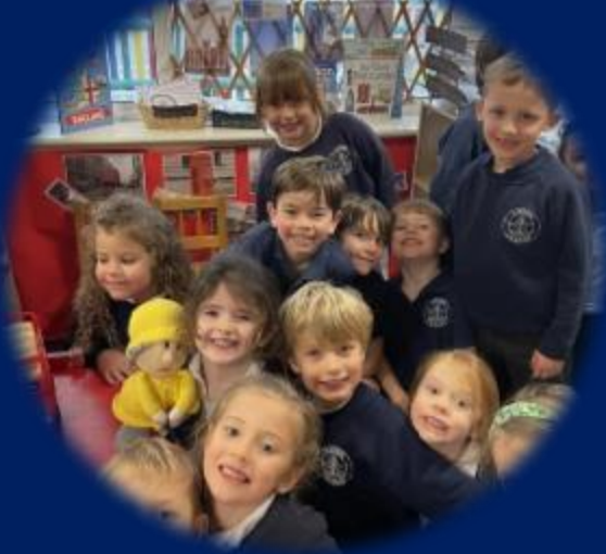
Excitement in topic immersion