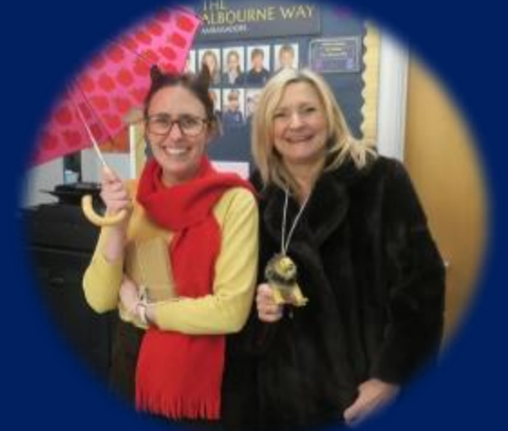
Ambitious for our staff – HET Humanities and Phonics leads