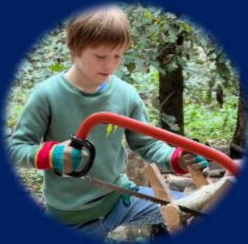
Ambitious for our talents

Children in our school will achieve highly because our expectations for pupil outcomes are ambitious. Children are supported and encouraged to achieve their God-given potential through the development of skills and knowledge as well as personal character. In doing so, pupils lay the foundations which will enable them to make a difference for themselves and the world in which they live, giving them hope and ambition for the future. They are resilient and able to deal with uncertainties and setbacks (Hebrews 12.1)