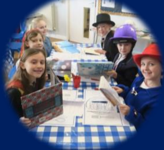
Whole school events – Book Bistro