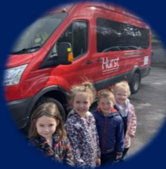
Off to Forest school @ Hurst