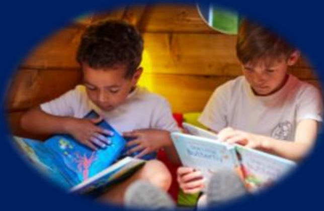
Reading results are well above National