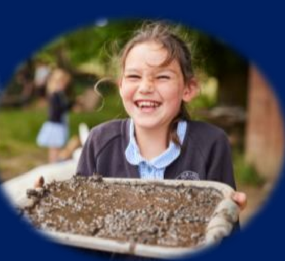
All ages can have fun