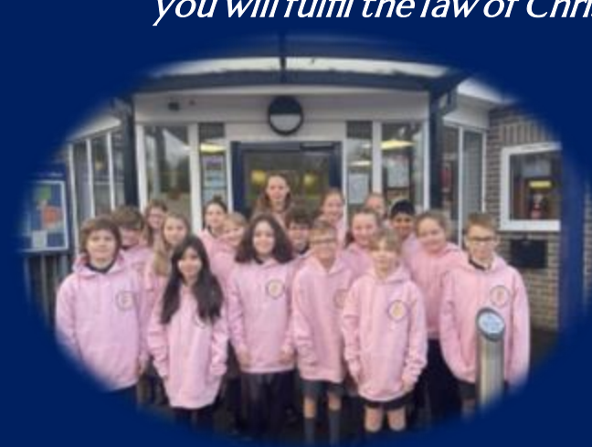
Our Peacekeepers, who facilitate friendships