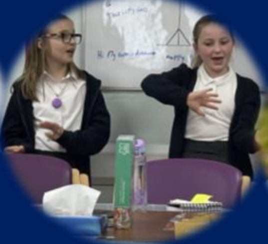
Singing with the older generation at a care home