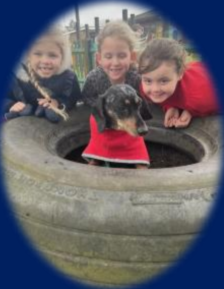
Star, our school dog who visits us

By following The Albourne Way, children are encouraged to grow into confident individuals with a strong sense of integrity, able to build strong, trusting relationships with others and give them a voice. “Carry each other’s burdens, and in this way you will fulfil the law of Christ.” Galatians 6:2