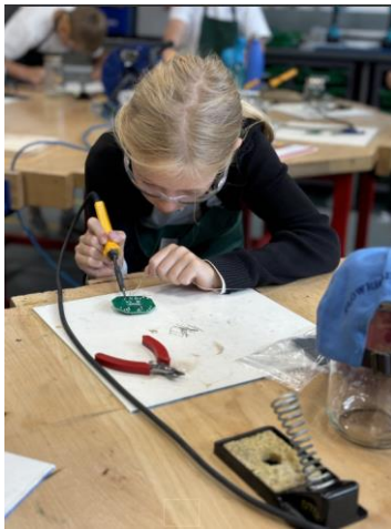
Learning to solder