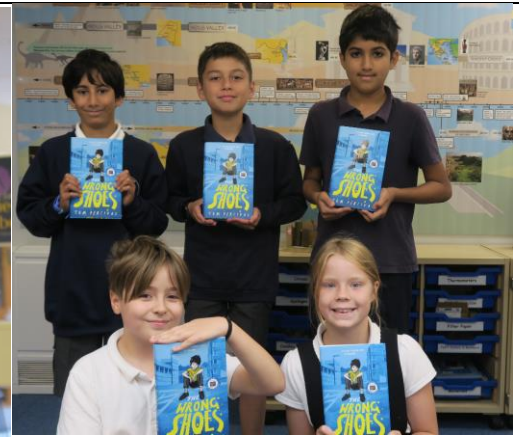
Book Club @Hurst