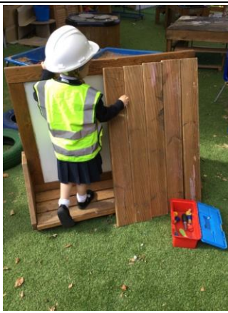
Forest Beach School