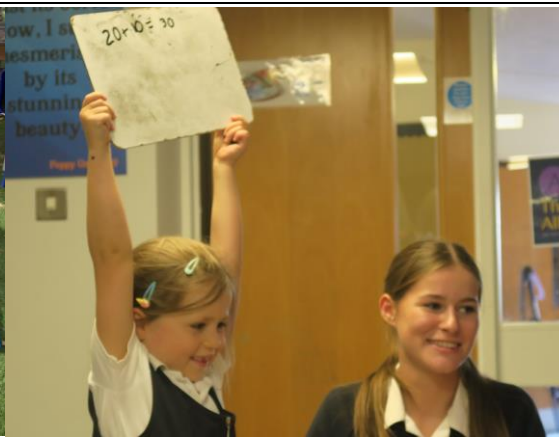
Hurst Number Wizards