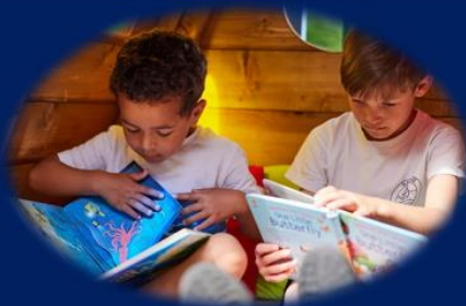
Reading results are well above National

Our vision is: The Albourne Way - Living life to the full. Albourne Church of England Primary School is ambitious, nurturing and an exciting learning community. Using our Christian Values, children follow The Albourne Way, are encouraged to flourish, become independent learners, be the person they are capable of being and live their life to the full. We have been taking sections of the vision and working with the children on what that means starting with, Albourne Church of England Primary School is ambitious – see below