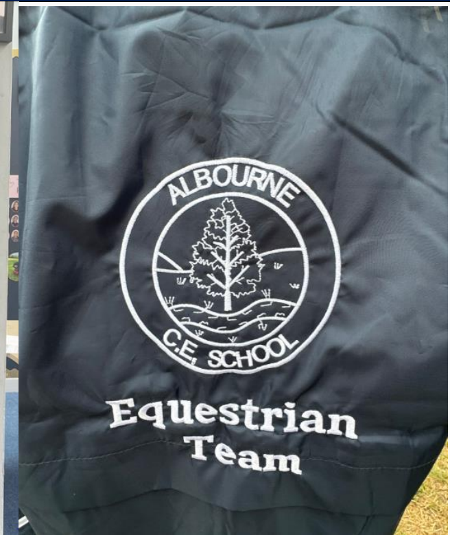
Best in Show Albourne Village Fair