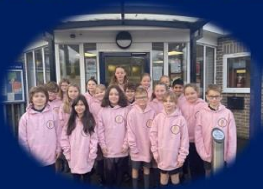
Peacekeepers, who facilitate friendships