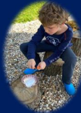
Beach, forest school