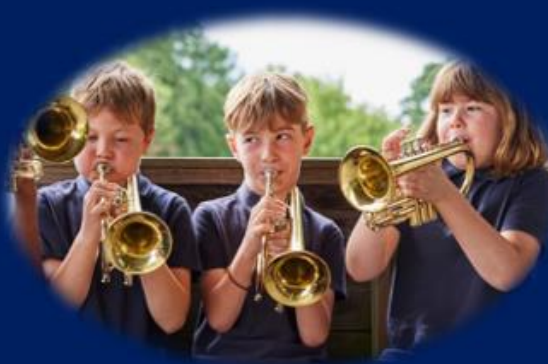
Learning to play the djembe, ukulele and cornets