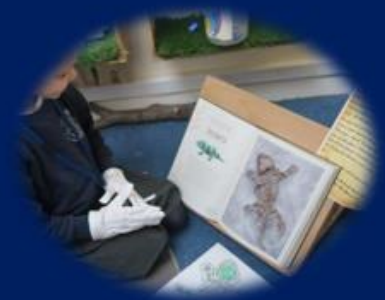
A letter from Mary Anning