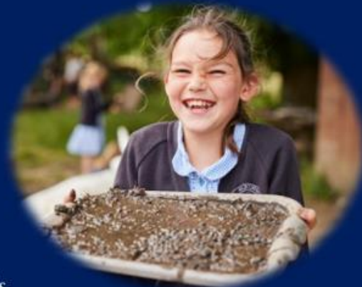
All ages can have fun