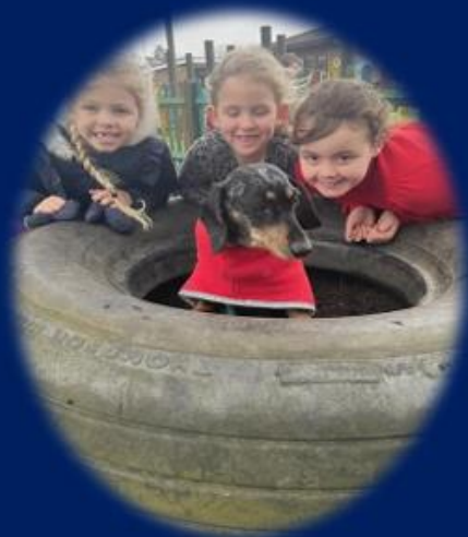
Star, our school dog who visits us

By following The Albourne Way, children are encouraged to grow into confident individuals with a strong sense of integrity, able to build strong, trusting relationships with others and give them a voice. "Carry each other's burdens, and in this way you will fulfil the law of Christ." Galatians 6:2