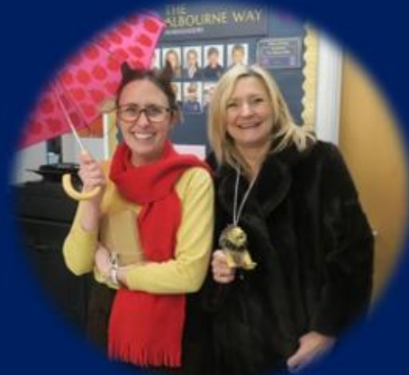
Ambitious for our staff – HET Humanities and Phonics leads