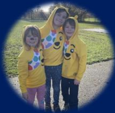
Fundraising for charity events