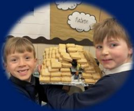
Exciting Home Projects

We are committed to ensuring a broad and balanced curriculum, enriched with skills, knowledge and experience that equip pupils for the future. The curriculum is broad, rich and ambitious, underpinned by its Christian vision and values. 'The heart of the discerning acquires knowledge, for the ears of the wise seek it out.' Proverbs 18:15