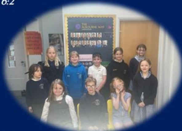
Our Diversity Ambassadors are improving understanding about Albourne Family