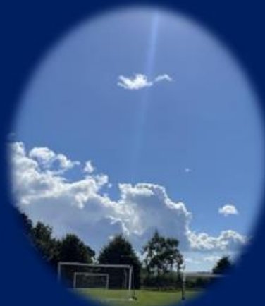
Caring for our beautiful grounds