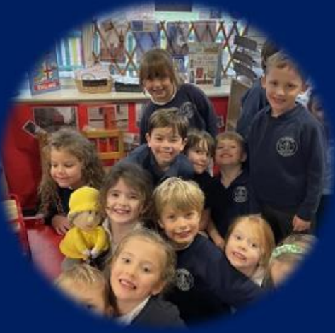
Excitement in topic immersion