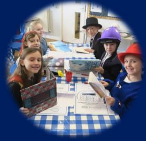
Whole school events – Book Bistro