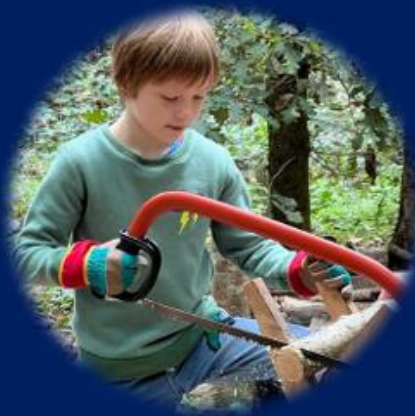
Ambitious for our talents

Children in our school will achieve highly because our expectations for pupil outcomes are ambitious. Children are supported and encouraged to achieve their God-given potential through the development of skills and knowledge as well as personal character. In doing so, pupils lay the foundations which will enable them to make a difference for themselves and the world in which they live, giving them hope and ambition for the future. They are resilient and able to deal with uncertainties and setbacks (Hebrews 12.1)