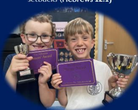
Ambitious for children to fulfil their potential